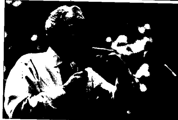
Lobbyists with ties to newly minted HELP Chairman Tom Harkin and his replacement as head of the Agriculture, Nutrition and Forestry Committee, Blanche Lincoln, are expected to see an upsurge in business.